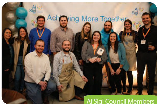
AI Sigl Council Members

Special thanks to Fairport Brewing on University Avenue for hosting our JustOne® Night Guest Bartending event this Fe-blue-ary, as volunteers from the AI Sigl Council, Foundation, Board of Governors, and Board of Trustees competed to raise funds and invite friends to learn more about AI Sigl.