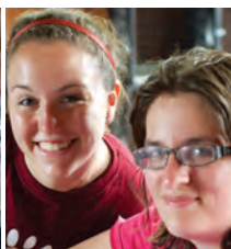
Empowering People's Independence