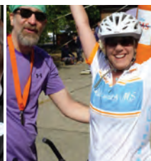
National MS Society Upstate NY