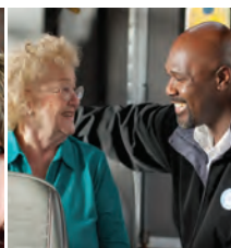
Medical Motor Service