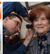
Rochester Hearing & Speech Center