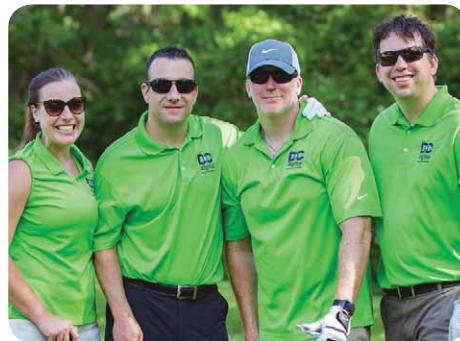
The D&C Digital team share a smile